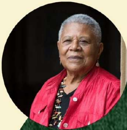
MINNIJEAN TRICKEY, MEMBER OF THE LITTLE ROCK NINE AND CIVIL RIGHTS ACTIVIST

FREE ENTRY WITH FOOD AND REFRESHMENTS PROVIDED